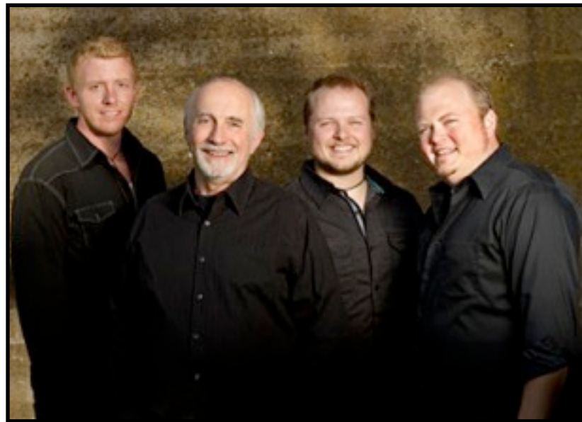
The Special Consensus

On January 26th, BASC held its first Bluegrass concert of the year featuring one of our favorite bands, The Special Consensus . The concert took place at the Mission Theatre at the Rancho Cordillera del Norte in Northridge -- a venue which is rapidly becoming one of our favorites, too.