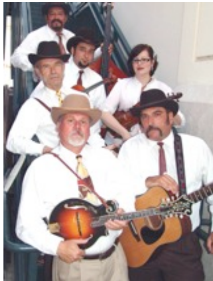
The Mill Creek Boys