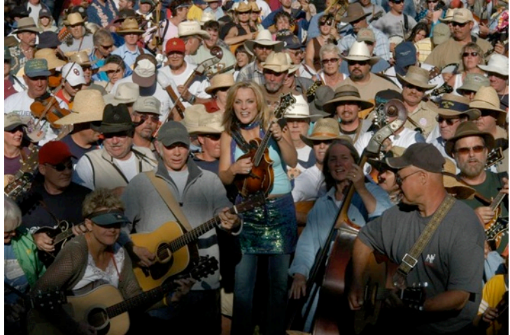
Rhonda Vincent and friends at the “World’s Biggest Bluegrass Jam”

Today, the Huck Finn Jubilee is the premier Bluegrass event of Southern California. Top bands from the East love to come to the Jubilee and Southern California Bluegrass fans love to see and hear them. As long as this combination continues, the Huck Finn Jubilee will enjoy many more years of success.