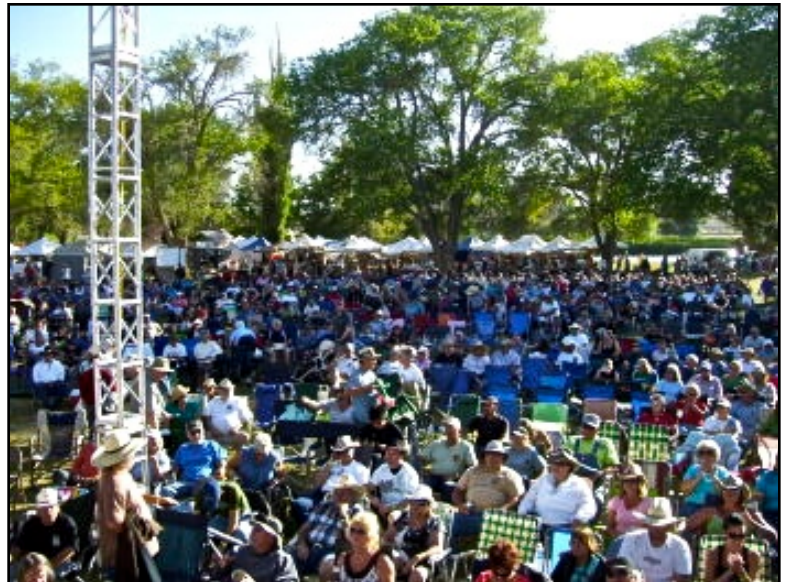
Enjoying the show on the main stage at the Huck Finn Jubilee