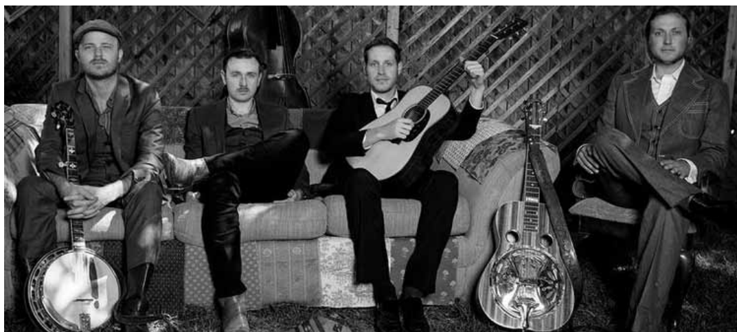
The Get Down Boys

Viva Cantina Mexican Restaurant 900 Riverside Drive, Burbank CA